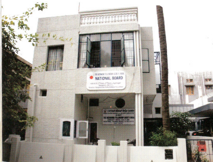
RFS (I) National Headquarters, Bangalore.

Dr. Thimmaiah Complex, Old Bus stand, Ramanagara - 571 511, ( Karnataka); Tel: (080) 7271289